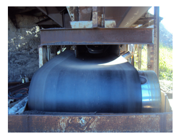
Before installation of Tru-Trac roller