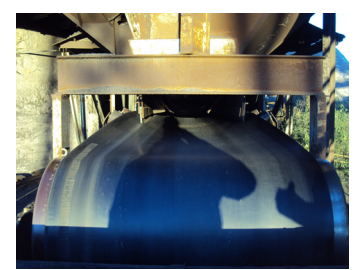
After installation of Tru-Trac roller

The new tracking technology by Tru-Trac is available in almost all belt widths and as option it can be produced according to the customers' wishes. The Tru-Trac tracking roller is delivered with a hot vulcanized rubber running surface. The two-bearing construction guarantees an optimal sealing. No existing tracking roller can compare to the Tru-Trac tracking roller.