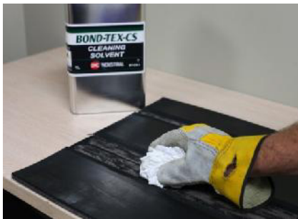
Use solvent to clean the repair area.