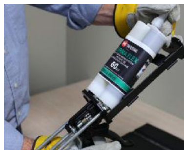
Insert cartridge into application tool.