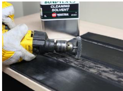
Buff the repair area.