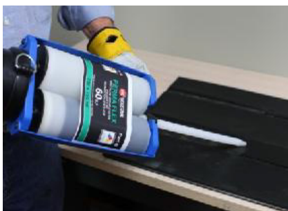
Use 750 cartridge for large area repairs.