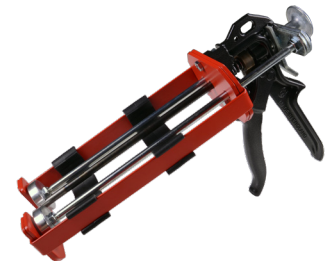
1 x dispensing tool