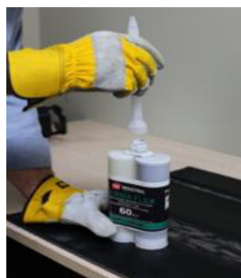
Screw on static mixer.