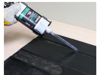
Apply Permaflex repair material.