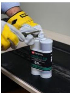
Remove seal cap.