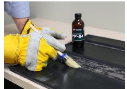
Apply the primer.